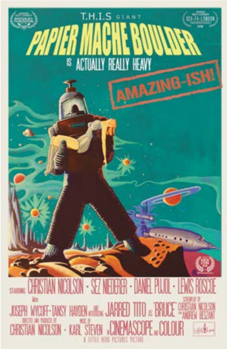
Special boulder retro posters by zephir delamore available